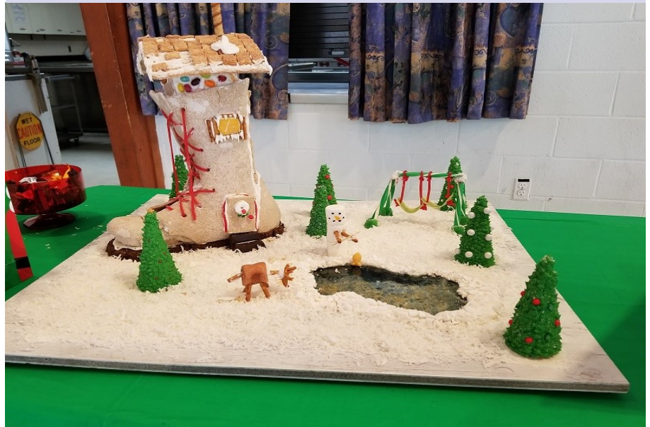
Adult/Family Category: Sara Nash