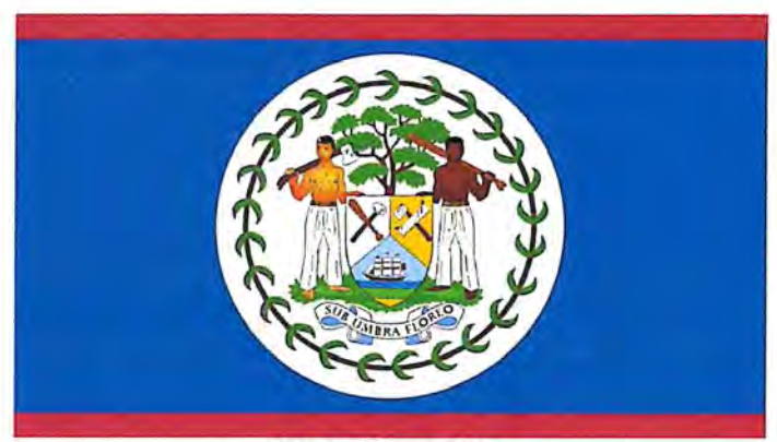
The Belizean Flag

The country of Belize has celebrated its 40<sup>th</sup> anniversary of political independence from Britain on Tuesday, September 21, 2021 under the theme: Belize at 40: Hopeful Hearts, Steady Hands, Together We Rise . In his speech of the day, Prime Minister John Briceno urged nationals here and abroad to participate in the various activities mindful of the presence of the coronavirus (COVID-19) pandemic that has curtailed much of the celebrations. Belize has implemented a state of emergency and has extended the COVID-19-related eighthour nightly curfew until now.